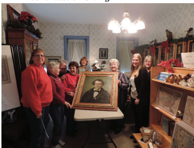
Photo: Lecompton Historical Society cataloged – diligently entered the measurements of, photographed, provided a description and provenance of – its 1,000th item, a painting of Jim Lane.