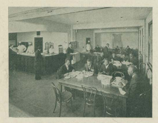
The Paseo Y. M. C. A. Cafeteria

The Cafe, on the second floor, is open seven days \epsilon week. It is an attractive room, with plenty of light and ventilation; good, wholesome food; everybody served, both men and women. Members may purchase "meal books" containing $2.75 in coupons for $2.50.