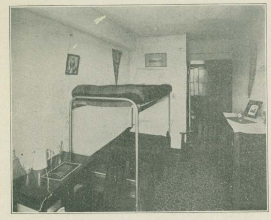
A Typical Dormitory Room

The Shower Baths.—Seven showers in a white enameled room. Plenty of hot and cold water.